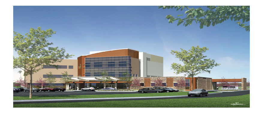
Lakeland Community Hospital – Watervliet, Michigan

Lakeland Community Hospital – Niles, Michigan